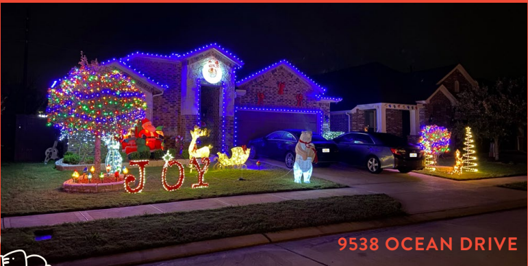
9538 OCEAN DRIVE