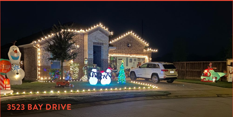
3523 BAY DRIVE