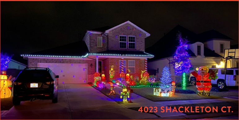
4023 SHACKLETON CT.