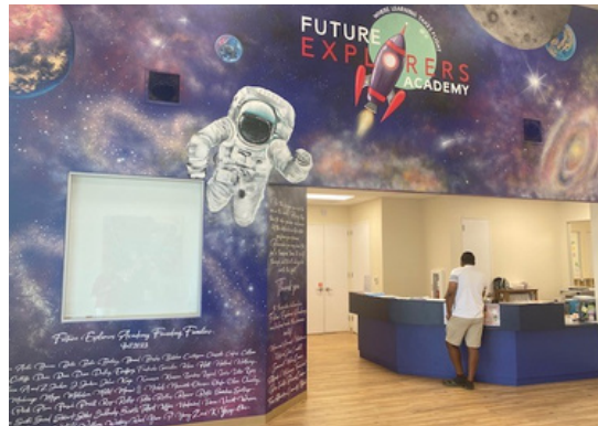
Future Explorers Academy