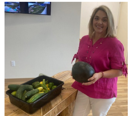
Vegetables from the Garden