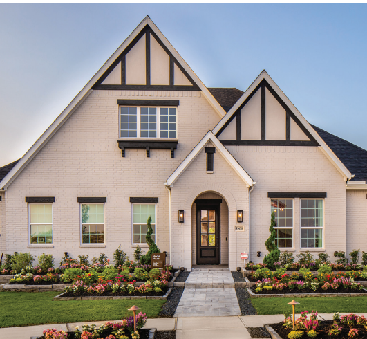
DREES CUSTOM HOMES