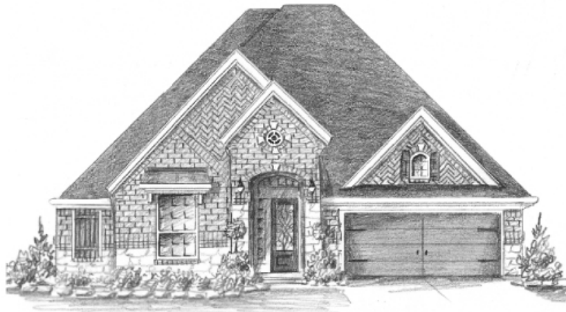
ELEVATION - C