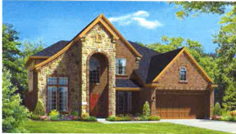
ELEVATION A - SHOWN W/ OPT. STONE