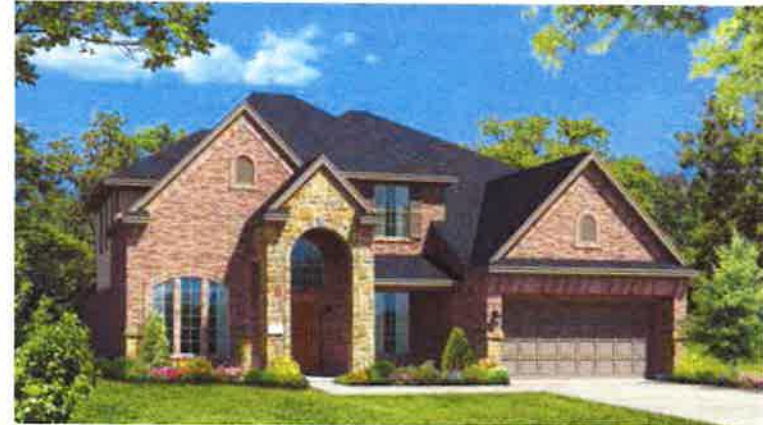
ELEVATION B - SHOWN W/ OPT. STONE