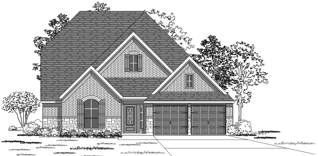
Design 2940W E-30