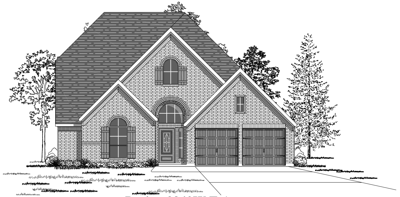
Design 2940W E-1