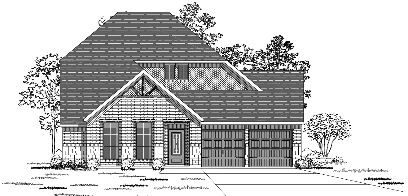
Design 2940W E-50

This design, as originally designed and prior to any changes you make, is estimated to yield approximately the number of square feet shown on page 1. All dimensions are approximate. Square footage may vary based on as-built dimensions, configurations, plan options and/or the method of calculation. Designs are not-to-scale, and are conceptual illustrations that may differ from construction plans or completed improvements. A design may depict features not available on all homesites or in all communities. Perry Homes reserves the right to make changes in plans and specifications, and to substitute material of similar quality. Prices, terms, promotions, plans, dimensions, features, options, amenities, elevations, designs, square footages, specifications, materials, and availability of homes or communities are subject to change without notice or obligation. All obligations will be governed by a written contract. This design does not constitute a commitment to build a particular floor plan or home in any given community. Some floor plans, options, and/or elevations may not be available on certain homesites or in a particular community and may require additional charges. Please check with Perry Homes to verify current offerings in the communities you are considering. This rendering is the property of Perry Homes, LLC. Any reproduction or exhibition is strictly prohibited.