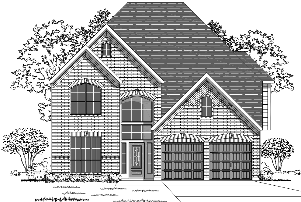
Design 2782W E-2