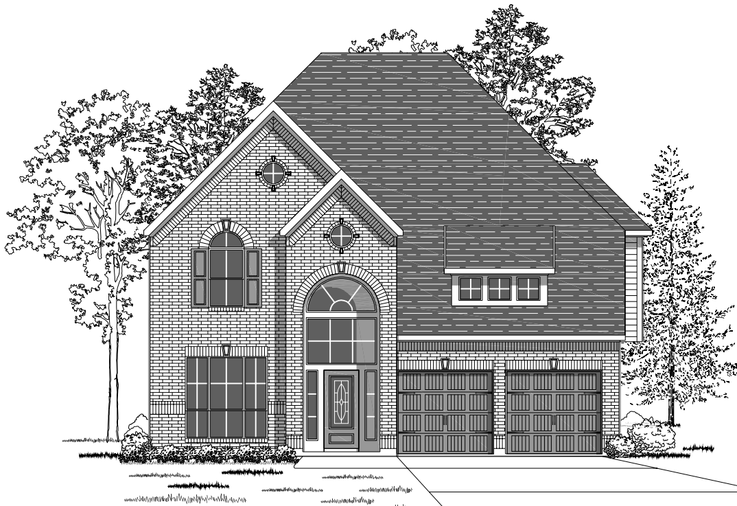
Design 2782W E-1