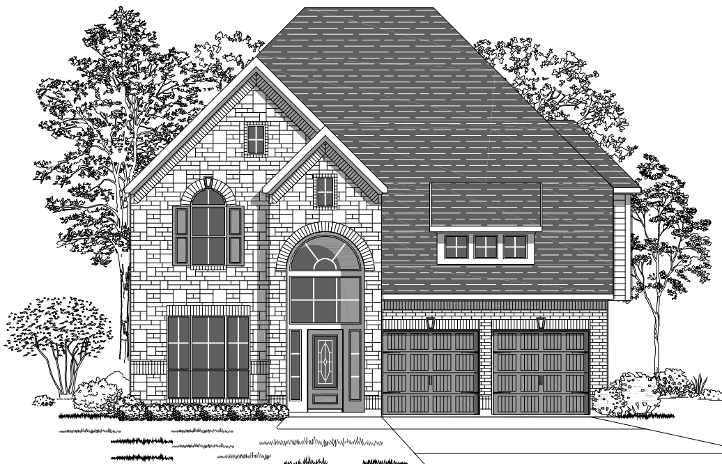
Design 2782W E-70

This design, as originally designed and prior to any changes you make, is estimated to yield approximately the number of square feet shown on page 1. All dimensions are approximate. Square footage may vary based on as-built dimensions, configurations, plan options and/or the method of calculation. Designs are not-to-scale, and are conceptual illustrations that may differ from construction plans or completed improvements. A design may depict features not available on all homesites or in all communities. Perry Homes reserves the right to make changes in plans and specifications, and to substitute material of similar quality. Prices, terms, promotions, plans, dimensions, features, options, amenities, elevations, designs, square footages, specifications, materials, and availability of homes or communities are subject to change without notice or obligation. All obligations will be governed by a written contract. This design does not constitute a commitment to build a particular floor plan or home in any given community. Some floor plans, options, and/or elevations may not be available on certain homesites or in a particular community and may require additional charges. Please check with Perry Homes to verify current offerings in the communities you are considering. This rendering is the property of Perry Homes, LLC. Any reproduction or exhibition is strictly prohibited.