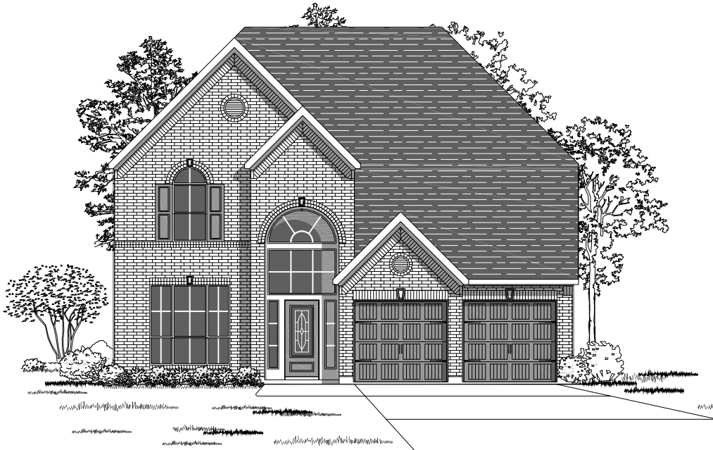
Design 2598W E-2