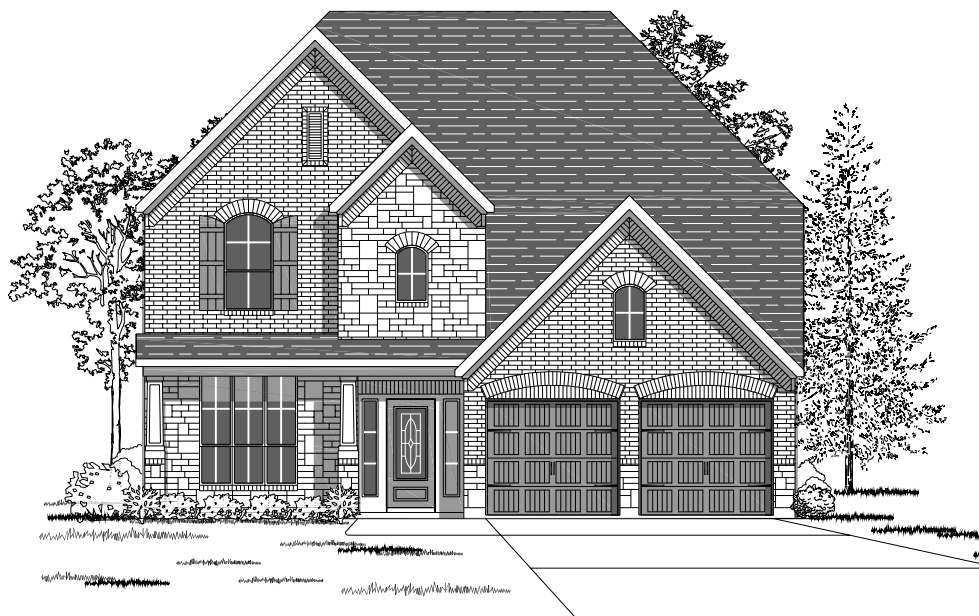
Design 2598W E-70