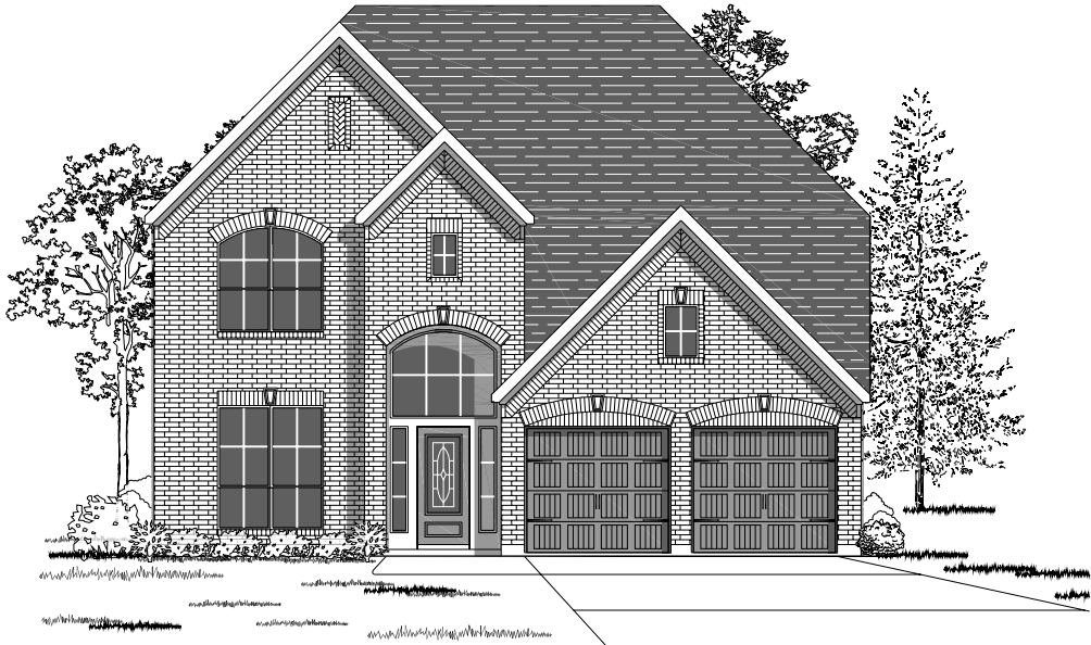
Design 2598W E-1